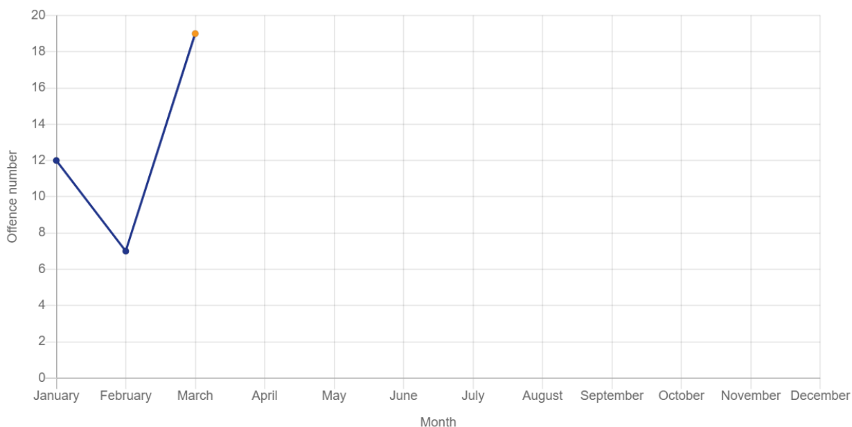
THE VINES Offences per Month of Calendar Year 2023

Please note below the graph and crime statistics are from WA Police web site. For more information please visit: https://www.police.wa.gov.au/crime/crimestatistics#/ . Please note the crime statistics are updated on a quarterly basis in the last week of January, April, July and October. Major Security Services will update the stats in our monthly report as soon as we received the update from WA Police website.