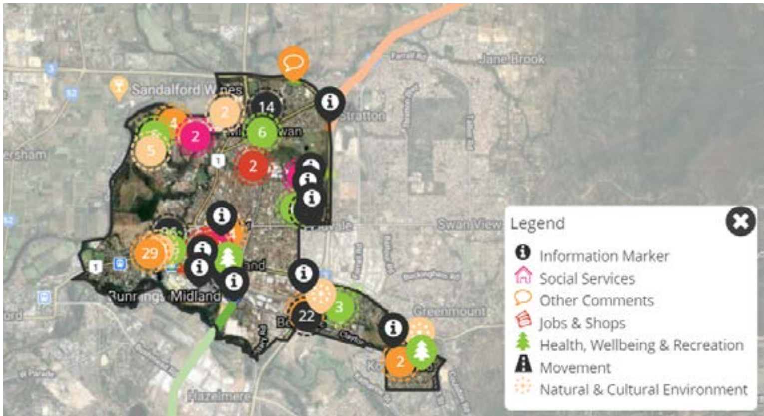
Midland Local Area Plan Social Pinpoint Page Stage One: https://cityofswan.mysocialpinpoint.com/midland-local-area-plan

358 people viewed the online consultation 1,122 times