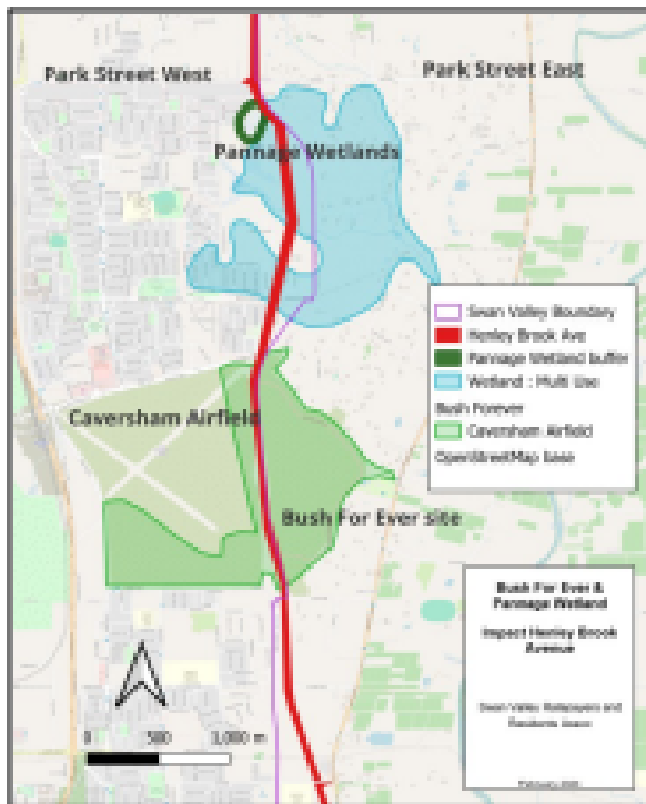
Figure 1. Location of Henley Brook Avenue in relation to Bush Forever 200 site and Pannage Wetlands