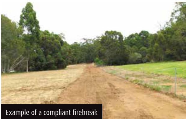
Example of a compliant firebreak

Where a property is affected by an approved bushfire management plan, property owners must still comply with all requirements of the Annual Fire Hazard Reduction Notice and with any additional requirements outlined within that plan.