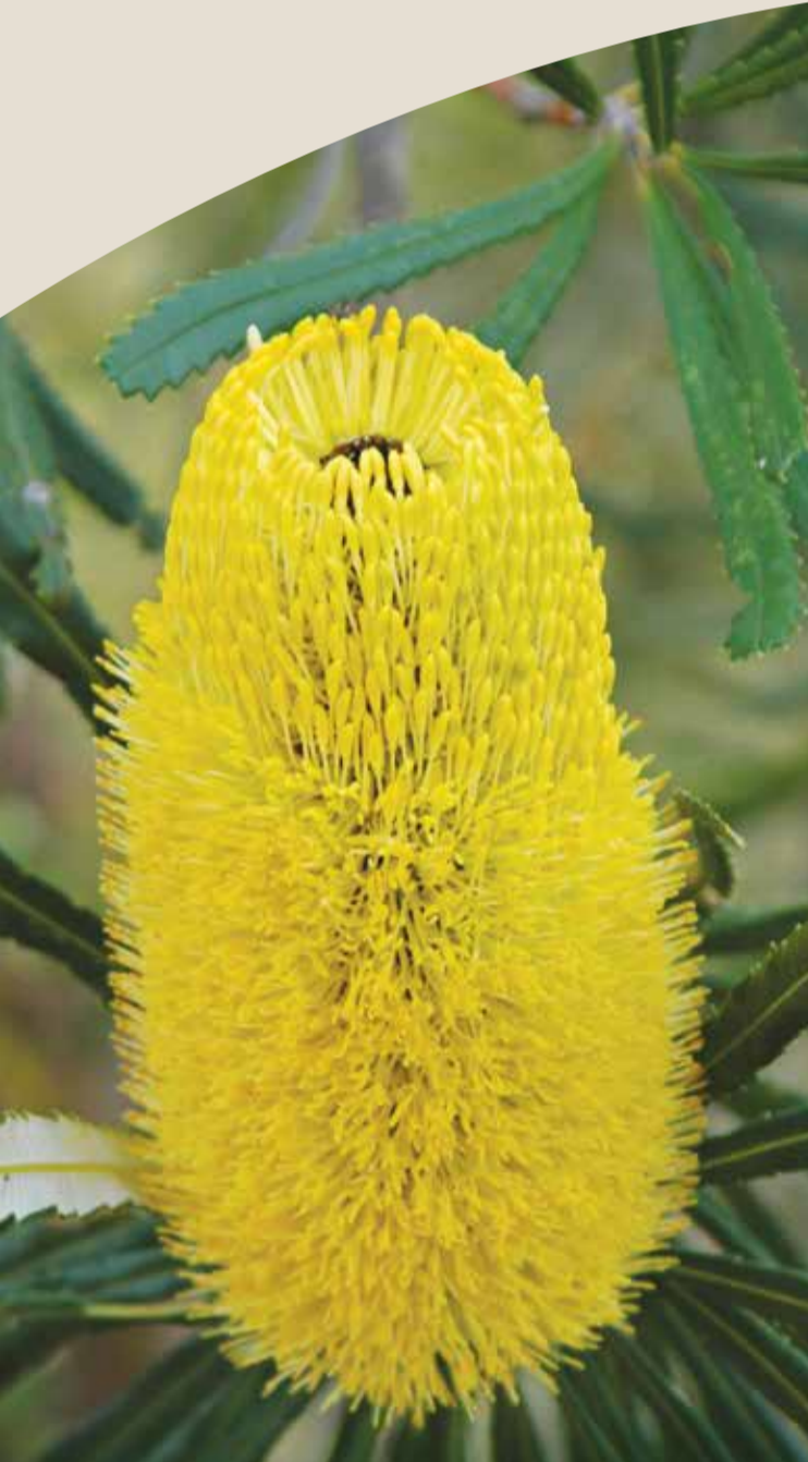
Candle Banksia Banksia attenuata