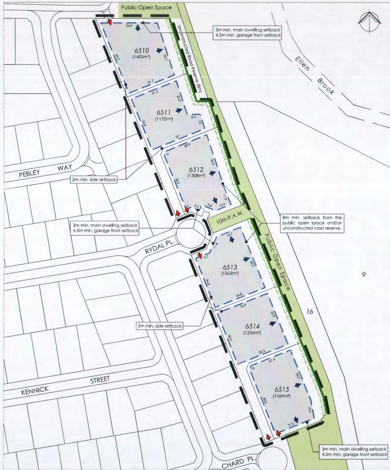
Diagram 1 (1:1500)