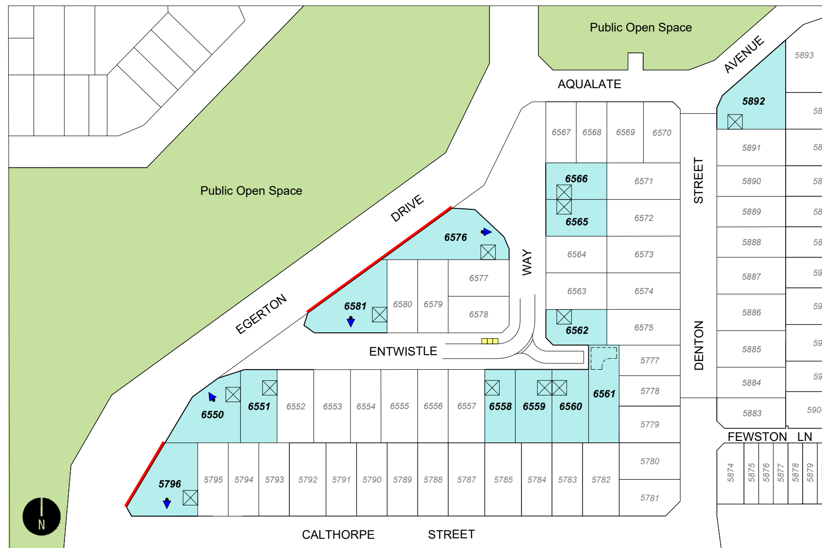
Diagram 1 (1:1,500)