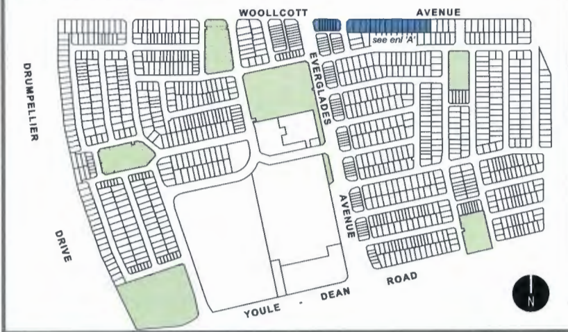
LOCATION PLAN (nts)

Disclaimer: The City makes every attempt to keep its published records up to date; however the subject document may have been superseded by a more recently approved document.